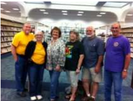
Jones Creek Library