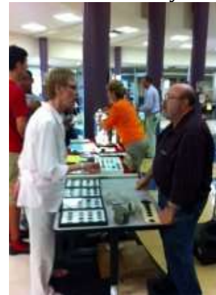
Woodlawn Science Fair